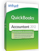
QuickBooks Accountant 2012