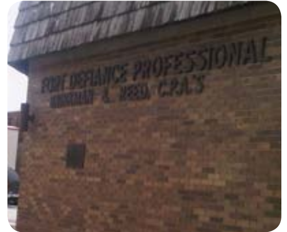
Brinkman & Reed, CPA's