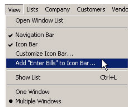
Figure 2 Adding Icons to the Icon Bar

For quick access to the areas of Enterprise Solutions you use most, you can customize the icon bar by adding many of the features and reports that you use most frequently.